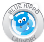
Blue Hippo Laundry Services & Retail