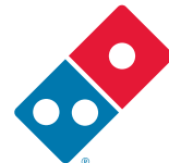
Domino's Fast Food, Cafes, Restaurants