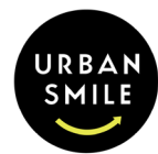
Urban Smile Health & Beauty