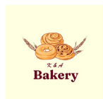
K & A Bakery Fast Food, Cafes, Restaurants