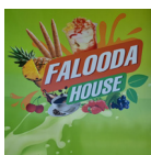
Falooda House Fast Food, Cafes, Restaurants